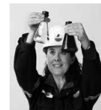
The post-treatment contrast