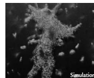
Various microbes digest impurities