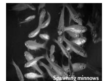
Tiny minnows test water purity

It's nature and technology at its best. From afar, our water treatment plant looks fairly typical. Yet, after wastewater passes through a complex system of filters and scrubbers, hungry microbes go to work removing pollutants, oil, and other by-products from refinery water. Once these microscopic workhorses have digested remaining impurities, tiny minnows check the water's purity.